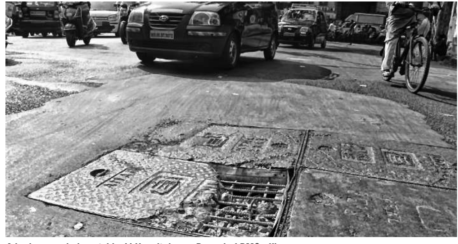
A broken manhole outside JJ Hospital near B ward of BMC office